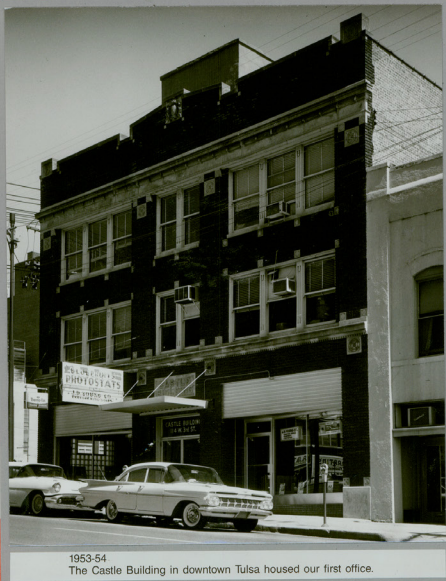
1953-54 The Castle Building in downtown Tulsa housed our first office.