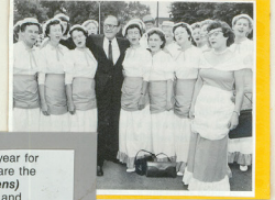
1959 was a popular year for entertainers. Shown are the Big Four (1953 Queens) with Danny Thomas, and the Lake County Chapter of Chicago, Illinois with Jack Benny.