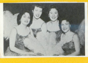
The Nightingals of Fullerton, California won the first Novice Award given in 1959.