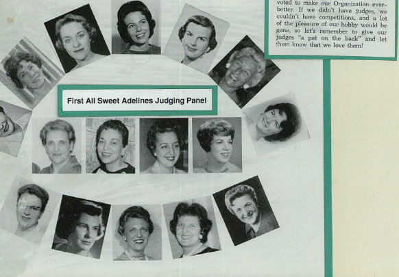
First All Sweet Adelines Judging Panel