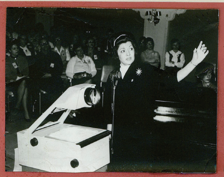
1964-65 MUSIC SCHOOL, DECEMBER 1964, KNICKERBOCKER HOTEL, CHICAGO, ILLINOIS