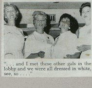
"... and I met these other gals in the lobby and we were all dressed in white, see, so..."