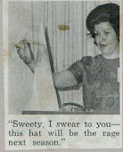
"Sweetie, I swear to you—this hat will be the rage next season."