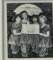
Four Oakland Crazy Crew Members rehearsing for the first International Convention on the West Coast in over a decade. Believe it or not, the shower is neither soap nor California Orange Juice. The water is from a garden hose!