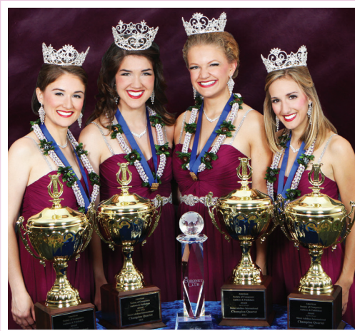
LOVENOTES 2014 International Champion Quartet