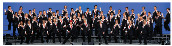
Rhythm Of The Rockies 2014 Division AA Champion Chorus