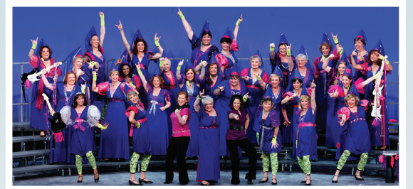
Carolina Harmony 2013 Division A Champion Chorus