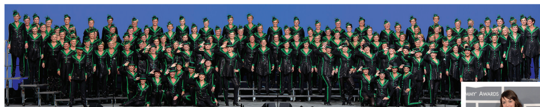
Rönninge Show 2014 International Champion Chorus