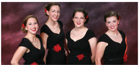
GQ 2013 Rising Star Champion Quartet