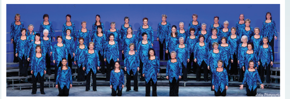
Westcoast Harmony 2013 Division AA Champion Chorus