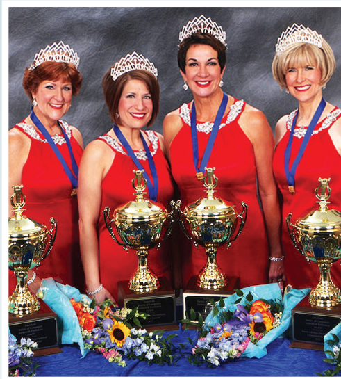
TOUCHÉ 2013 International Champion Quartet