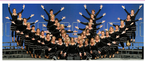
Pearls of the Sound 2014 Division A Champion Chorus