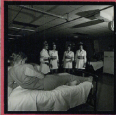
The 1972 Queens of Harmony, 4th Edition from Cleveland, Ohio entertain in hospitals on the first Sweet Adelines/USO Shows Stateside Hospital Tour.