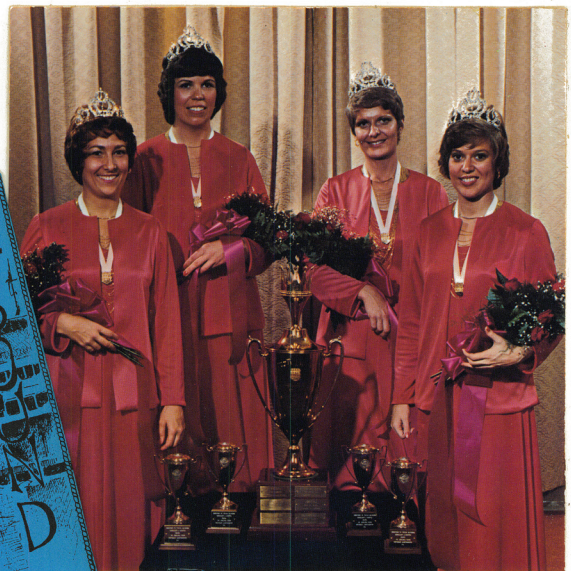
1975 Queens of Harmony Front Office Four