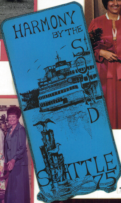
San Diego Chapter (#11) 1975 International Chorus Champions