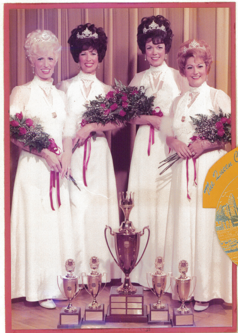
1976 Queens of Harmony High Society