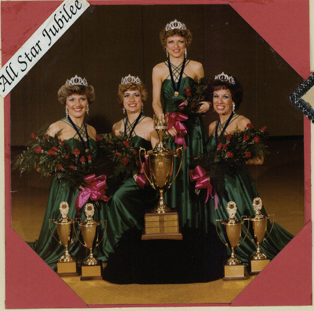
1981 Queens of Harmony

35th Annual International Convention and Competition PHOENIX