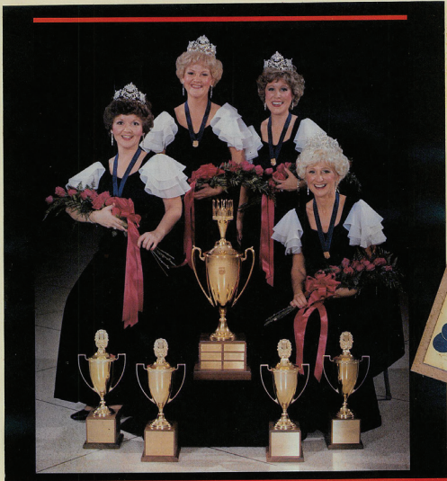
Music Gallery 1982 Queens of Harmony

Performance Package Required For 1982 Quartet Finalists At the 1982 International Convention in Minneapolis, something new and exciting will be happening in quartet competition. A Performance Package will be required of the ten finalists in International Quartet Competition.