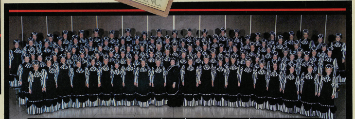
1982 International Chorus Champions Gem City Chapter Dayton, Ohio