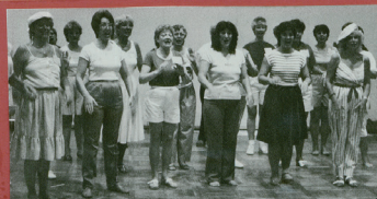
These Sweet Adelines are participating in "Planning Your Standing Ovation" at the 1985 summer seminar in Tahlequah, Okla.

After much deliberation, the International Board of Directors voted at its winter meeting against a name change for the organization. Any decision to change our name must be the responsibility of the International Board of Directors, and they must look to the best interests of the corporation in making that choice. While lots of clever and inventive names were submitted, no one name was found which completely filled the organization's needs.