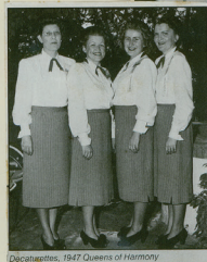
Dizonettes, 1947 Queens of Harmony