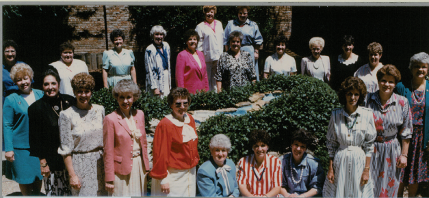
Council of Regents