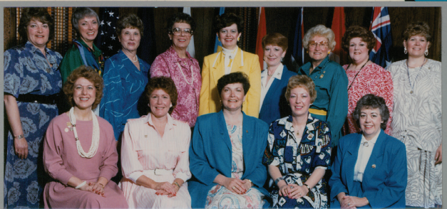
International Board of Directors

"Showcase! 1987" Featuring Worldwide Region Performers!