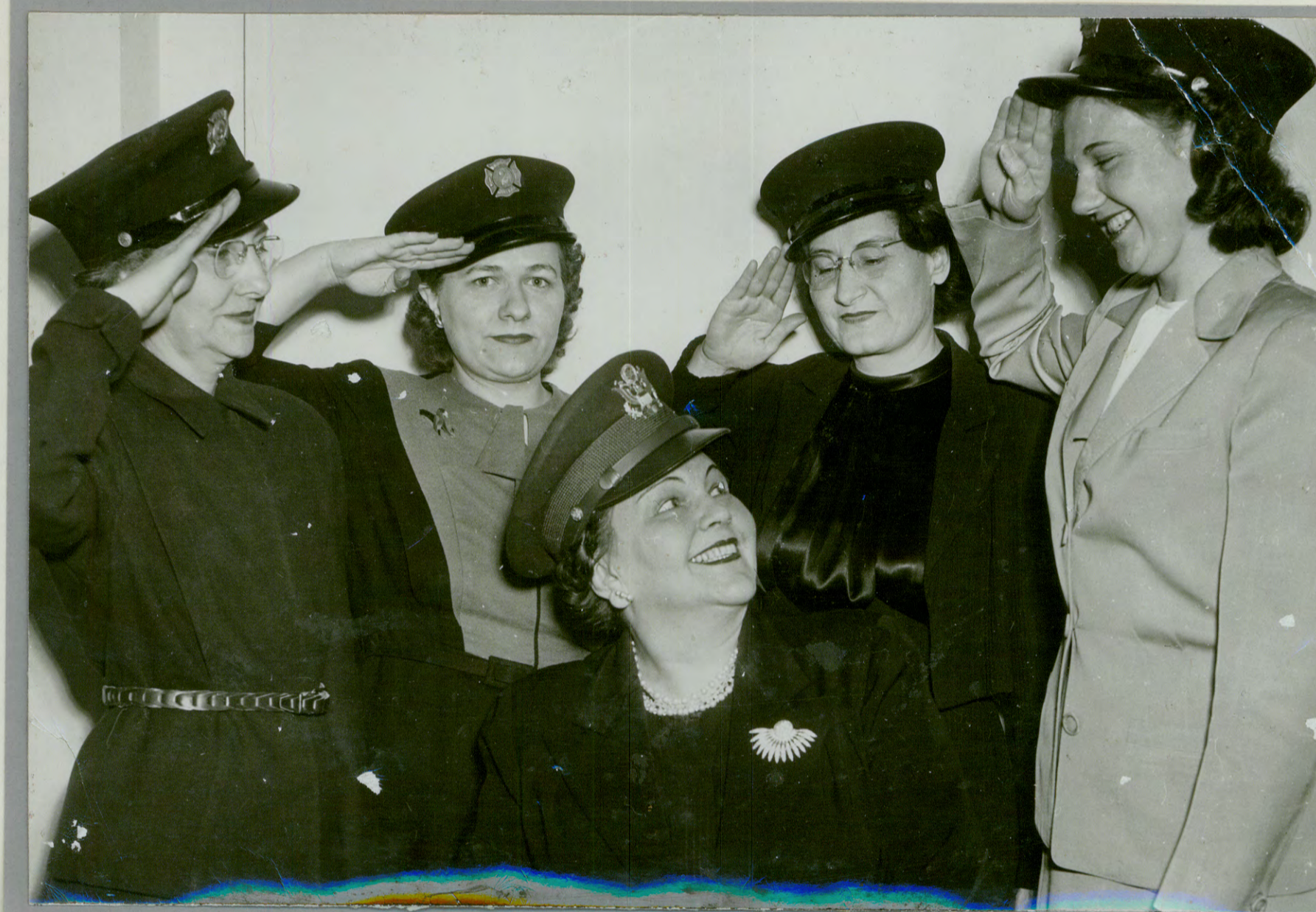
1947 This photo appeared in a Tulsa Tribune article, February 24, 1947, over the headline "Recruit for Adelines — or Sweet Adelines Wants You!"