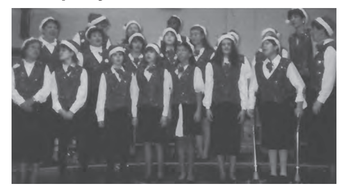
The Barbershop Singers of the Indiana School for the Blind (USA) were among many Young Women in Harmony choruses that sang in the 90s. The Barbershop Singers were affiliated with Capital City Chorus.

For the Youth: The Young Women in Harmony (YWIH) program, approved in 1989, took effect in 1990, and choruses immediately began programs for young singers. Throughout the 1990s, young choruses and quartets flourished, and in 1999, the first Rising Star Quartet Contest was held at the first International Education Symposium at Trinity University in San Antonio, Texas (USA). Thirteen quartets competed, and Dazzling Diamonds of Michigan won the contest. The Pitch Pipe reported that, "The Rising Star Quartet Contest left attendees feeling that the future of barbershop is bright."